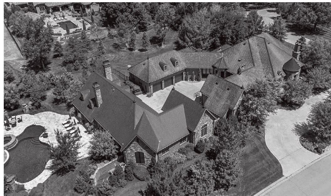
1931 N. TIMBERWOOD WICHITA

From multi-million dollar deals to investment properties, our commitment to service stays consistent and still ends in "sold!" Here are a few of our most unique and successful auctions throughout the year.