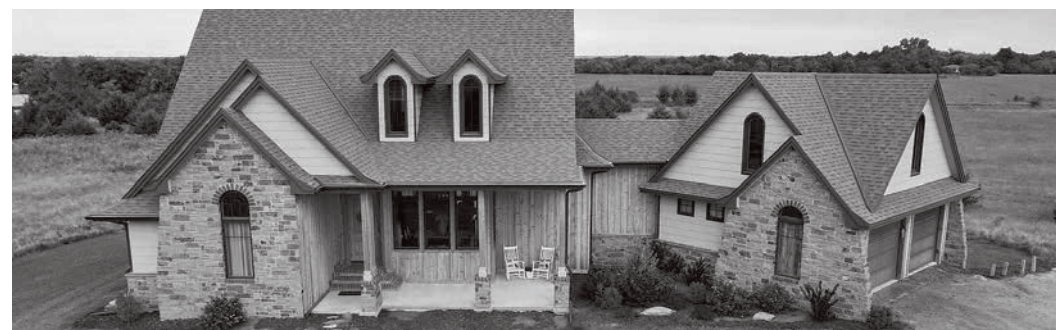
9333 SW HAVERHILL RD. (STONE HILL BARN) AUGUSTA

Absolute -Wichita living is refined within this 9,100 Sq. Ft. estate nestled back on 1.54 acres sold at online only auction in March.